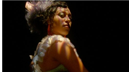
PIDIKWE de Caroline Monnet Canada | 2024 | 10 min