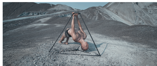
SAINT-RÉMI de Simon Vermeulen Canada | 2024 | 4 min