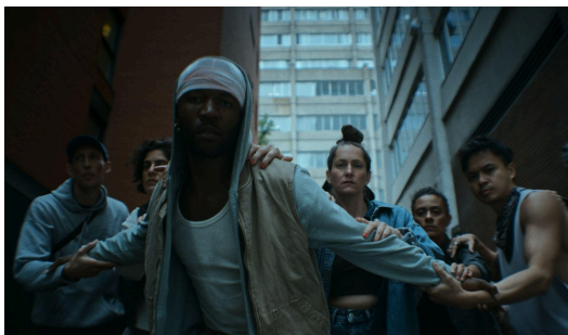
À BRAS-LE-CORPS de Chélanie Beaudin-Quintin Canada | 2024 | 14 min